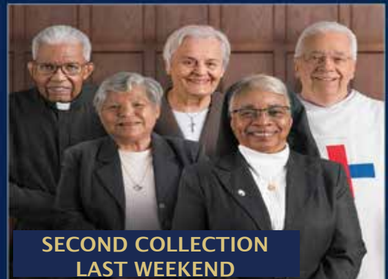
SECOND COLLECTION LAST WEEKEND

To learn more about how your gift helps, visit retiredreligious.org .